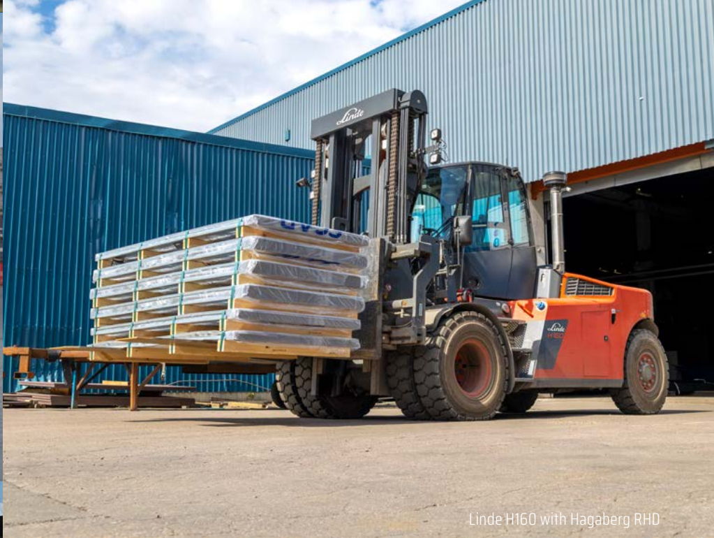
Linde H160 with Hagaberg RHD