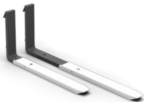
ManuTel® G2 - Standard