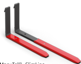
ManuTel® - SlimLine

ManuTel® is a problem solver for companies that often handle goods of varying lengths. The solution is to have manual reachforks always at hand and time efficient to handle. They are available as integrated forks along with fork positioners as well as Hook-on (ISO forks).